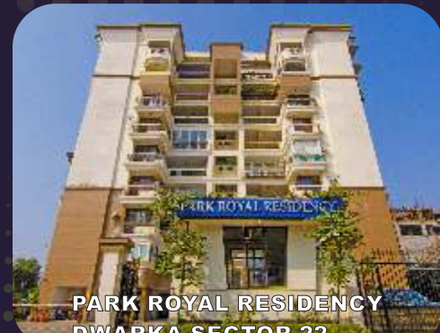
PARK ROYAL RESIDENCY DWARKA SECTOR-22