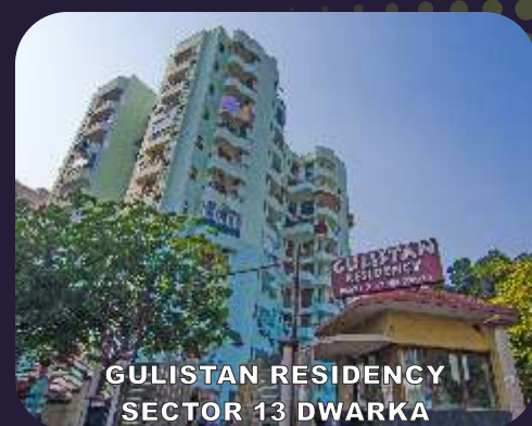
GULISTAN RESIDENCY SECTOR 13 DWARKA