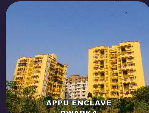
APPU ENCLAVE DWARKA