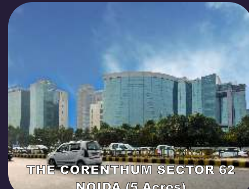
THE CORENTHUM SECTOR 62 NOIDA (5 Acres)