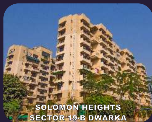
SOLOMON HEIGHTS SECTOR 19-B DWARKA