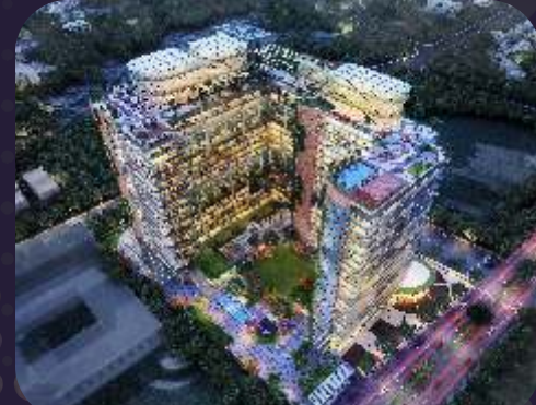
ANTHURIUM SECTOR-73 NOIDA