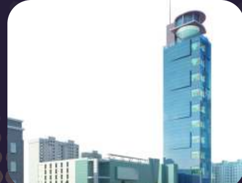
THE ICONIC CORENTHUM SECTOR-62 NOIDA