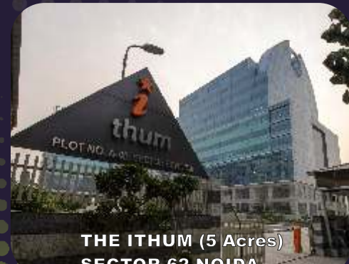
THE ITHUM (5 Acres) SECTOR 62 NOIDA