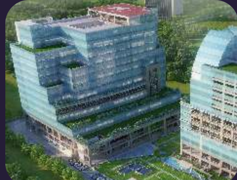
THE ITHUM (PHASE II) SECTOR-62 NOIDA